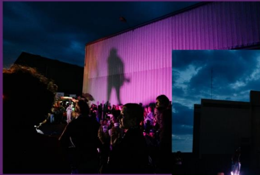
KONVOOI festival, 2023 Het Entrepot, Brugges