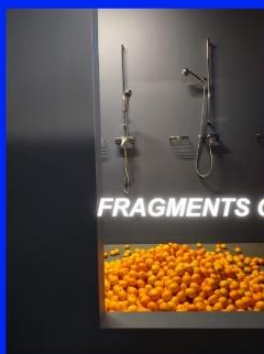
FRAGMENTS OF BLUE PLANETS