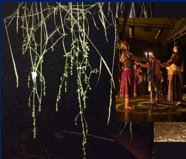
Witchez Gathering La Manufacture, 2023 Switzerland