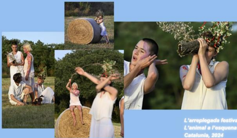
L'arreglada festival L'animal a l'esquena Catalunia, 2024