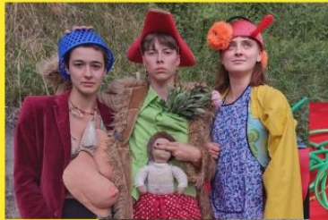
Red carpet parking La Manufacture, 2022 Switzerland