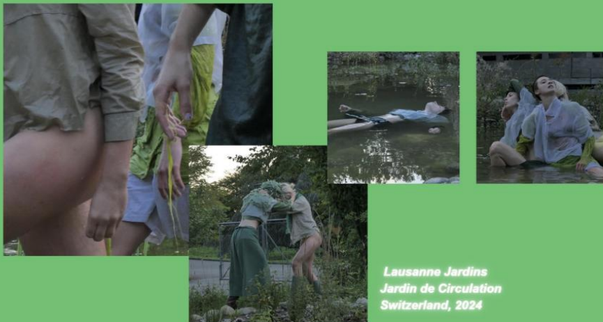
Lausanne Jardins Jardin de Circulation Switzerland, 2024